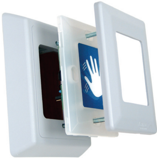
U-WAV is easy to install